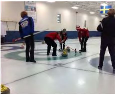
View of the house.