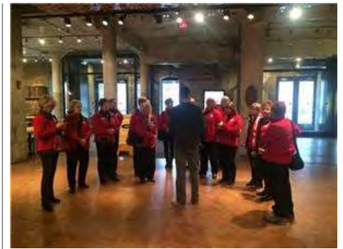
First day's results.