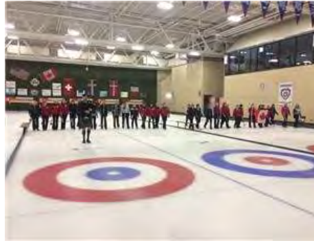
Teams Piped In