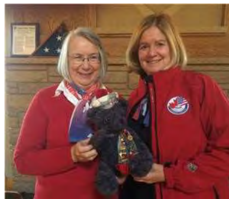
Tour Couriers with Hudson