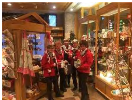
Group Photo with Couriers