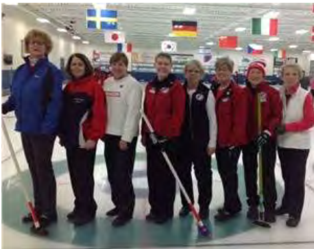
More smiles after a hard fought game.