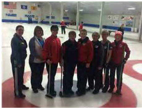
A group photo op in the Mill Flour Tower.