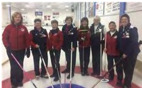
Chisholm Team 2.