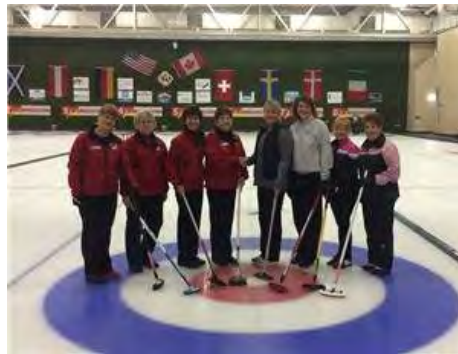
Hall vs. Docteur