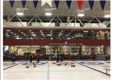
View Toward the Glass.