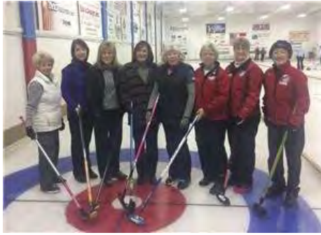
French vs. Danich