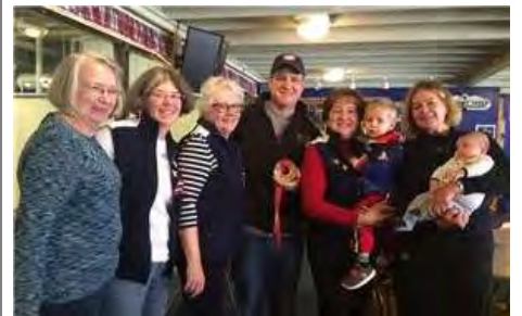
2012 Sr. Friendship Tour members with John Shuster and his boys.