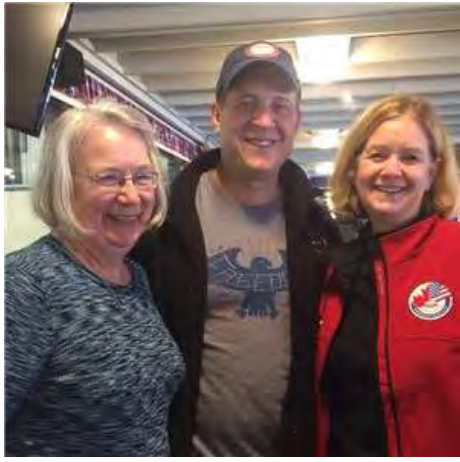
The Canadians demonstrate the use of a Buff!