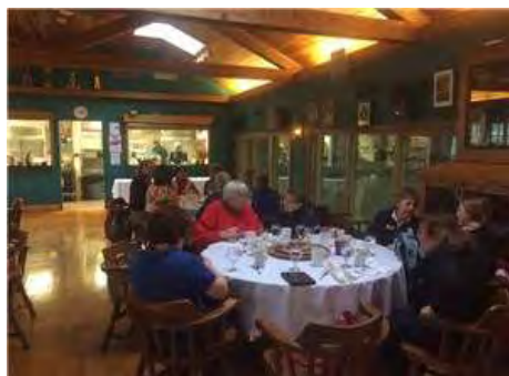
Lunch in the Upstairs Warm Room