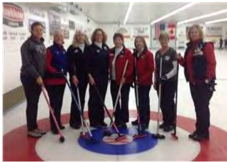
The tour makes the newspaper.