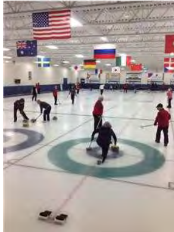
Inside the USA Curling National Training Center.