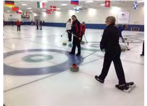
Delivering the rock.