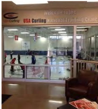
Looking out onto the ice from behind the glass.