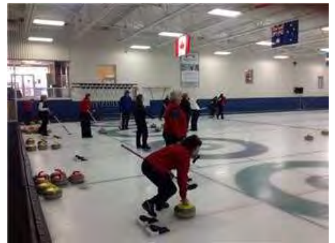
The beautiful 6 sheet facility.