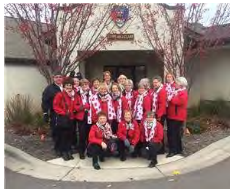
Tour Group Outside the St. Paul CC