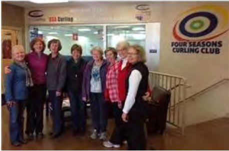
The Centerville Ladies join the tour.