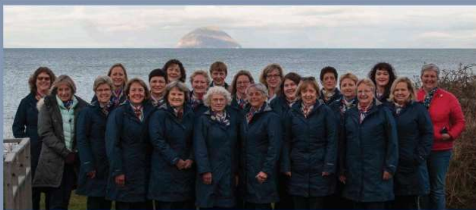
Ailsa Craig and Culzean Castle