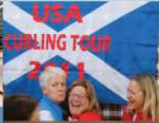
First Time on the Ice